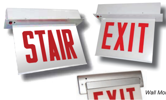
Wall Mount option